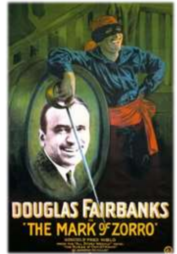
Click to Play

100 years ago, on 12/5/1920, United Artists released The Mark of Zorro starring Douglas Fairbanks as Señor Zorro. Fairbank's character lived a seemingly ordinary life as Don Diego Vega, a mild and unnoticeable rich kid, but when an injustice was perpetrated on the vulnerable common folk, he transformed himself into their swashbuckling defender. Zorro was one of the first movie superheroes, the original double-identity masked avenger. Recognizing its commercial potential, Zorro spawned remakes, spin-offs and sequels galore appearing in over 40 films, radio and TV series, comic books, stage productions and even video games. When The Mark of Zorro hit theatres in 1920, the US was beginning to emerge from the double shocks of World War I and the Spanish Flu pandemic, and was sorely in need of escapism and renewal. Fairbanks and United Artists did their part to lift the mood and lead the country into recovery.